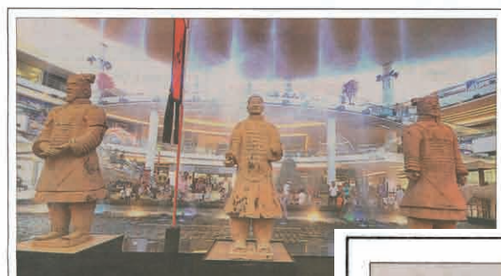
On guard ... Life-sized warriors are on sentry duty around the fountain at Aberdeen Centre exhibit, The Return of the First Emperor of China, on display at the centre until Aug. 30.

BRAIDWOOD Taser ban not needed New guidelines required By NELSON BENNETT benbennet@richmond-news.com Tasers should not be banned in B.C., but the provincial government needs to set strict new guidelines that would limit their use by municipal police. That is the general recommendation made Thursday by retired justice Thomas