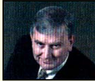
MALCOLM PARRY VANCOUVER SUN COLUMNIST

TOWN TALK | A couple of alfresco dinners draw an eclectic mix of guests